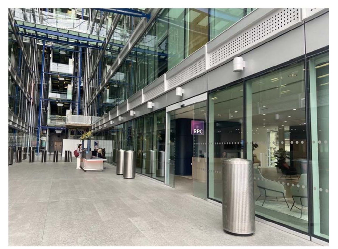
Street Level Entrance to the Building. RPC Reception located on the right. Access to our Ground 1 meeting rooms available through RPC reception.