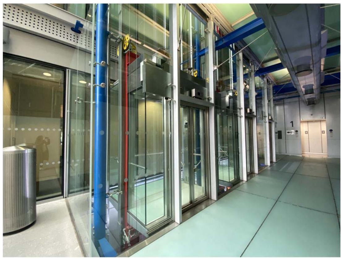
Lifts up to our working floors (3 & 4).