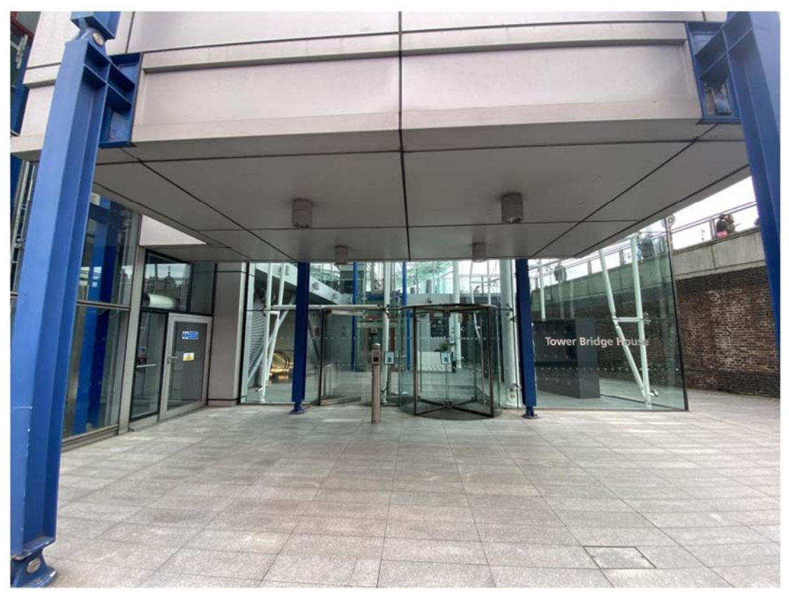
Dockside Level Reception & lift up to main reception.